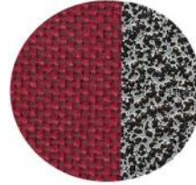
Regal Red (MB-07)/ Silvervein (FF08-11)