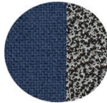
Dark Blue (MB-05)/ Silvervein (FF08-11)