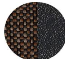
Espresso (MB-29) / Tex. Blk. (FF08-20)