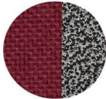
Maroon (MB-16)/ Silvervein (FF08-11)