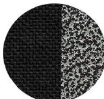
Black (MB-21)/ Silvervein (FF08-11)