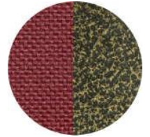
Fabric: Maroon Frame Finish: Goldvein 392-MN-GV105