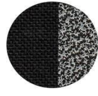
Fabric: Black Frame Finish: Silvervein 392-BLK-SV110