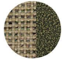
Fabric: Mixed Tan Frame Finish: Goldvein 392-MT-GV108