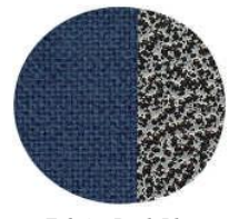
Fabric: Dark Blue Frame Finish: Silvervein 392-DB-SV104