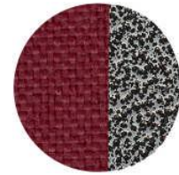
Fabric: Maroon Frame Finish: Silvervein 392-MN-SV102