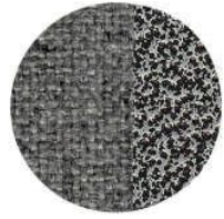
Fabric: Charcoal Frame Finish: Silvervein 392-CH-SV109