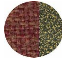
Fabric: Sparkler Frame Finish: Goldvein 392-SK-GV107