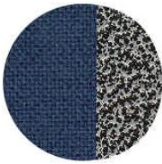
Fabric: Dark Blue Frame Finish: Silvervein 157-SV-MB101