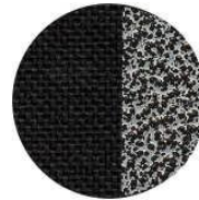
Fabric: Black Frame Finish: Silvervein 157-SV-MB108