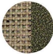
Fabric: Mixed Tan Frame Finish: Goldvein 157-GV-MB105