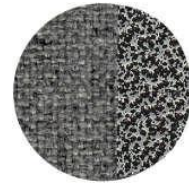
Fabric: Charcoal Frame Finish: Silvervein 157-SV-MB111