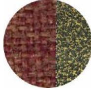
Fabric: Cinnamon Frame Finish: Goldvein 157-GV-MB107