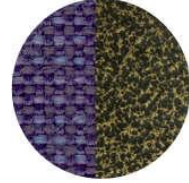
Fabric: Amethyst Frame Finish: Goldvein 157-GV-MB110