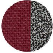
Fabric: Maroon Frame Finish: Silvervein 157-MB16-104