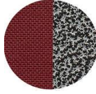
Fabric: Burgundy Frame Finish: Silvervein 157-SV-MB100