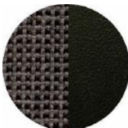
Fabric: Fossil Frame Finish: Sandtex Black 157-STB-MB113