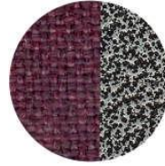
Fabric: Grape Frame Finish: Silvervein 157-SV-MB103