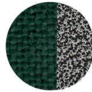
Fabric: Dark Green Frame Finish: Silvervein 157-SV-MB102