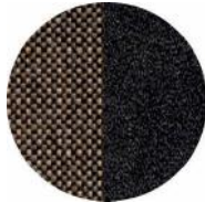
Fabric: Jute Frame Finish: Sandtex Black 157-STB-MB112