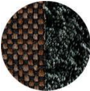
Fabric: Java Frame Finish: Sandtex Black 157-STB-MB106