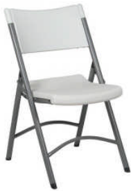
A1100 Matching Folding Chairs Contoured Seat & Back