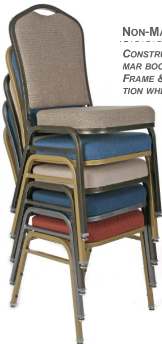
CHAIRS STACK 10 HIGH FOR MAXIMUM STORAGE!

HIGHLY RECOMMENDED FOR CHAIRS THAT ARE STACKED FREQUENTLY. THE BARS ALIGN THE CHAIRS TO STACK SQUARELY ; WHILE ALSO HELPING TO REDUCE WEAR AND TEAR ON THE SEAT UPHOLSTERY.