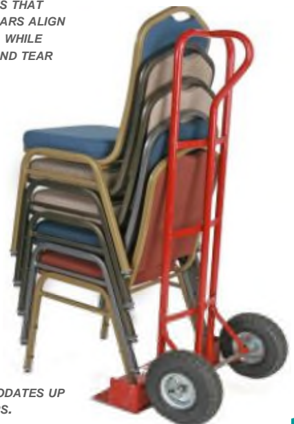
136-DOLLY-CT EASILY ACCOMMODATES UP TO (10) 193C/194C/195C CHAIRS.