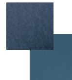
IMPERIAL BLUE FABRIC BLUE FRAME [N2204]