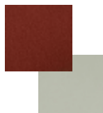
MAJESTIC CABERNET FABRIC GREY FRAME [N2208]