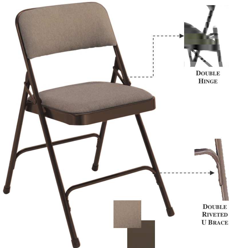
RUSSET WALNUT FABRIC BROWN FRAME [N2207]