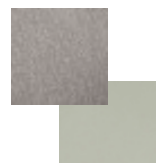
GREYSTONE FABRIC GREY FRAME [N2202]