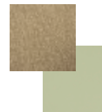
CAFÉ BEIGE FABRIC BEIGE FRAME [N2201]