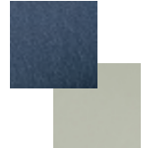
IMPERIAL BLUE FABRIC GREY FRAME [N2205]