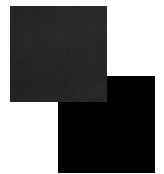
BLACK FABRIC BLACK FRAME [N2210]