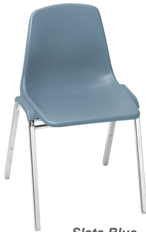
Slate Blue N8115