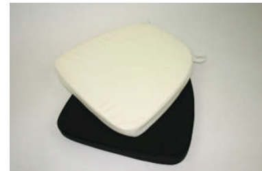
Cushions available in ivory and black