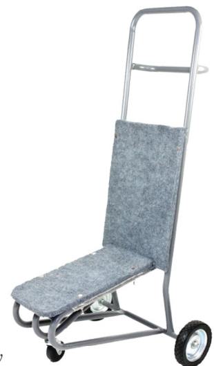
ADY-7000 Chair Mover Dolly