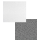
SPECKLED GREY PLASTIC GREY FRAME [N602]