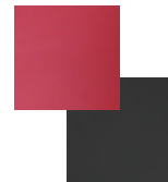
RED PLASTIC BLACK FRAME [N640]