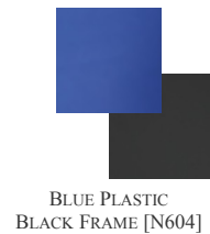
BLUE PLASTIC BLACK FRAME [N604]

BACKED BY LIMITED MANUFACTURER WARRANTY, OFFERED TO THE ORIGINAL USER/PURCHASER AGAINST ALL MANUFACTURER DEFECTS IN MATERIAL AND WORKMANSHIP FOR 10 YEARS.