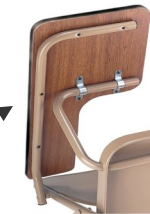
FORTIFIED W/ DUAL BRACKETS UNDER TABLET