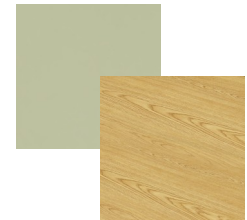
LIGHT OAK TABLET BEIGE FRAME [N5201R/L]