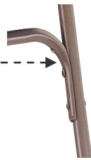
DOUBLE RIVETED U BRACE