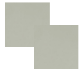
GREY TABLET GREY FRAME [N5202R/L]