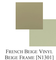
FRENCH BEIGE VINYL BEIGE FRAME [N1301]