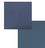
DARK MIDNIGHT BLUE VINYL CHAR BLUE FRAME [N1304]