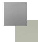
WARM GREY VINYL GREY FRAME [N1302]