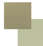
FRENCH BEIGE VINYL BEIGE FRAME [N1201]