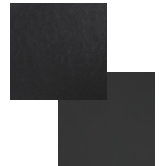
CAVIAR BLACK VINYL BLACK FRAME [N1210]