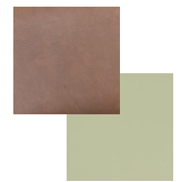
HONEY BROWN VINYL BEIGE FRAME [N1203]