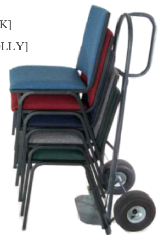
KDY-DOLLY TRANSPORTS (8-10) CHAIRS