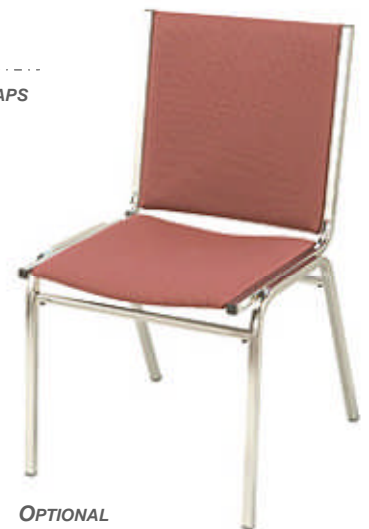
OPTIONAL 1" THICK SEAT [134K-1]

DUAL UNDER SEAT SUPPORT STRAPS ARE STANDARD FOR ADDED STRENGTH AND SUPPORT!