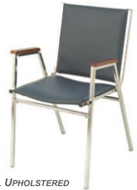
OPTIONAL VINYL UPHOLSTERED ARMED CHAIR WITH 1" THICK SEAT [135KV-1]