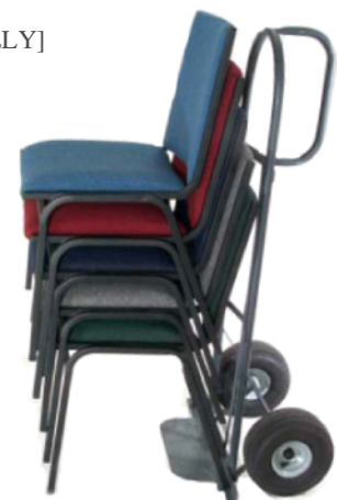
KDY-DOLLY TRANSPORTS (8-10) CHAIRS