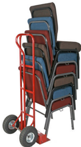
136-CT DOLLY, STACKS 8-10 HIGH