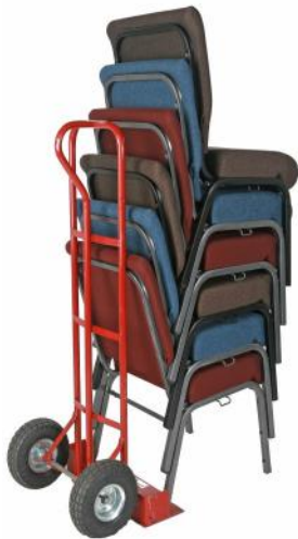
136-CT DOLLY, STACKS 8-10 HIGH