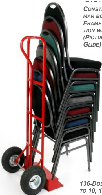
136-DOLLY-CT EASILY ACCOMMODATES UP TO 10, 128C CHAIRS FOR MAXIMUM STORAGE

CONSTRUCTED WITH A BLACK NON-MAR BOOT GLIDE FOR INCREASED FRAME & UPHOLSTERY PROTECTION WHEN STACKING! (PICTURED WITH UPGRADED SWIVEL GLIDE)