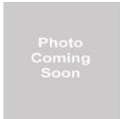
Photo Coming Soon

Highly recommended for chairs that are stacked frequently. The bars align the chairs to stack squarely; while also helping to reduce wear and tear on seat upholstery.