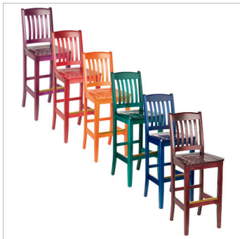
Stain Colors Shown Above 6 of 14 Colors Shown Not Shown 14 Wood Stains

Upholstered seats as well as solid wood seats are available. The wood seats are sculpted at the factory to ensure a comfortable sitting position.