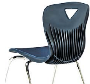
Ribbing designed to provide added support.