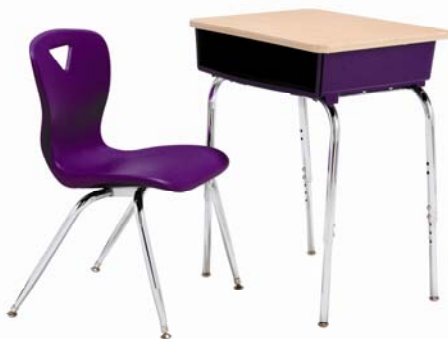
Shown with Open Front Desk